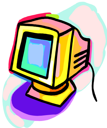
Learning computers is fun!